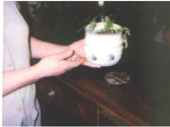
White Water Marks?