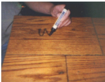
Magic Marker & Ink Stains?